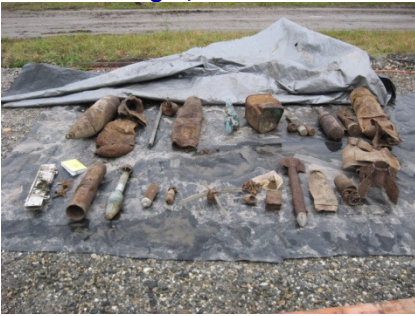
Recovered MECs from Taku Gardens jobsite at Ft. Wainwright, AK

Taku Gardens Environmental Investigation and Remediation Ft. Wainwright, AK