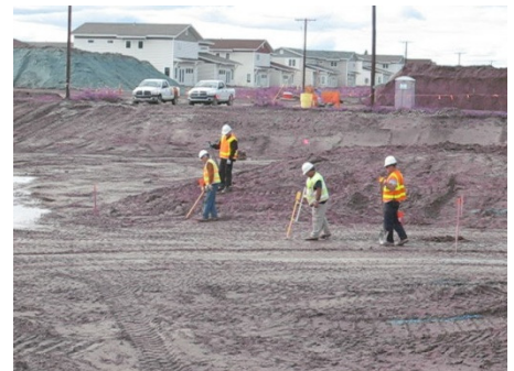
MEC Screening process with UXO Technicians using Schonstedt Magnetometer