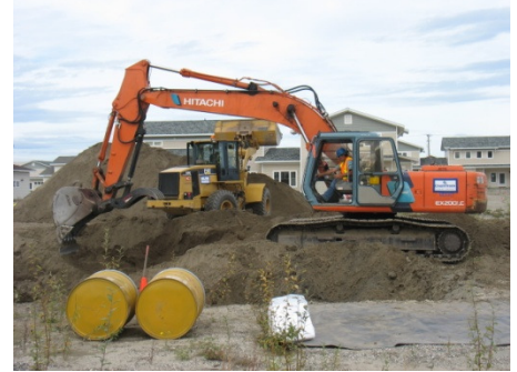
Investigation and Removal of Metal Debris, PCBs, Drums and Munitions and Explosives of Concern (MECs)