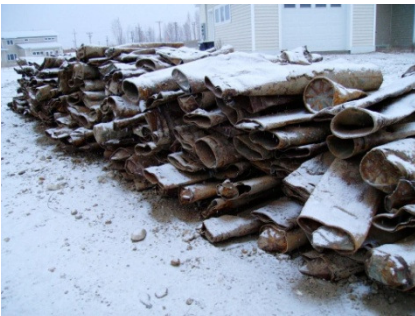
Unexploded Ordnances (UXOs)