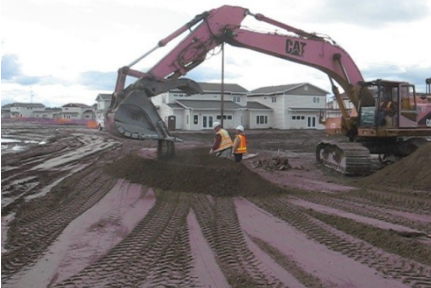
MEC Sifting process with UXO Technicians