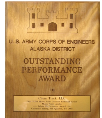
ChemTrack received the US Corps of Engineers Safety Performance Award.